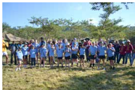
1st Ladysmith Cubs and Scouts rearing to go on their hike.